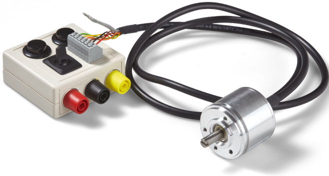
Picture shows programmer with connected rotary encoder. The rotary encoder is not part of delivery.